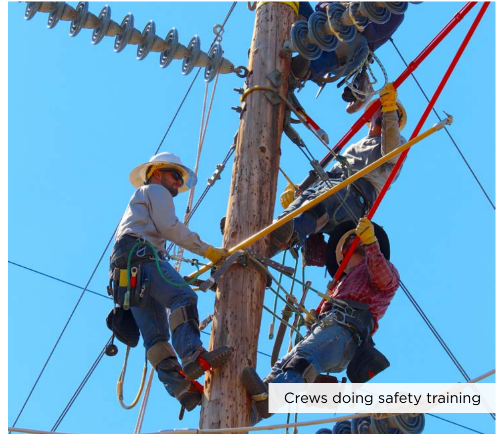
Crews doing safety training