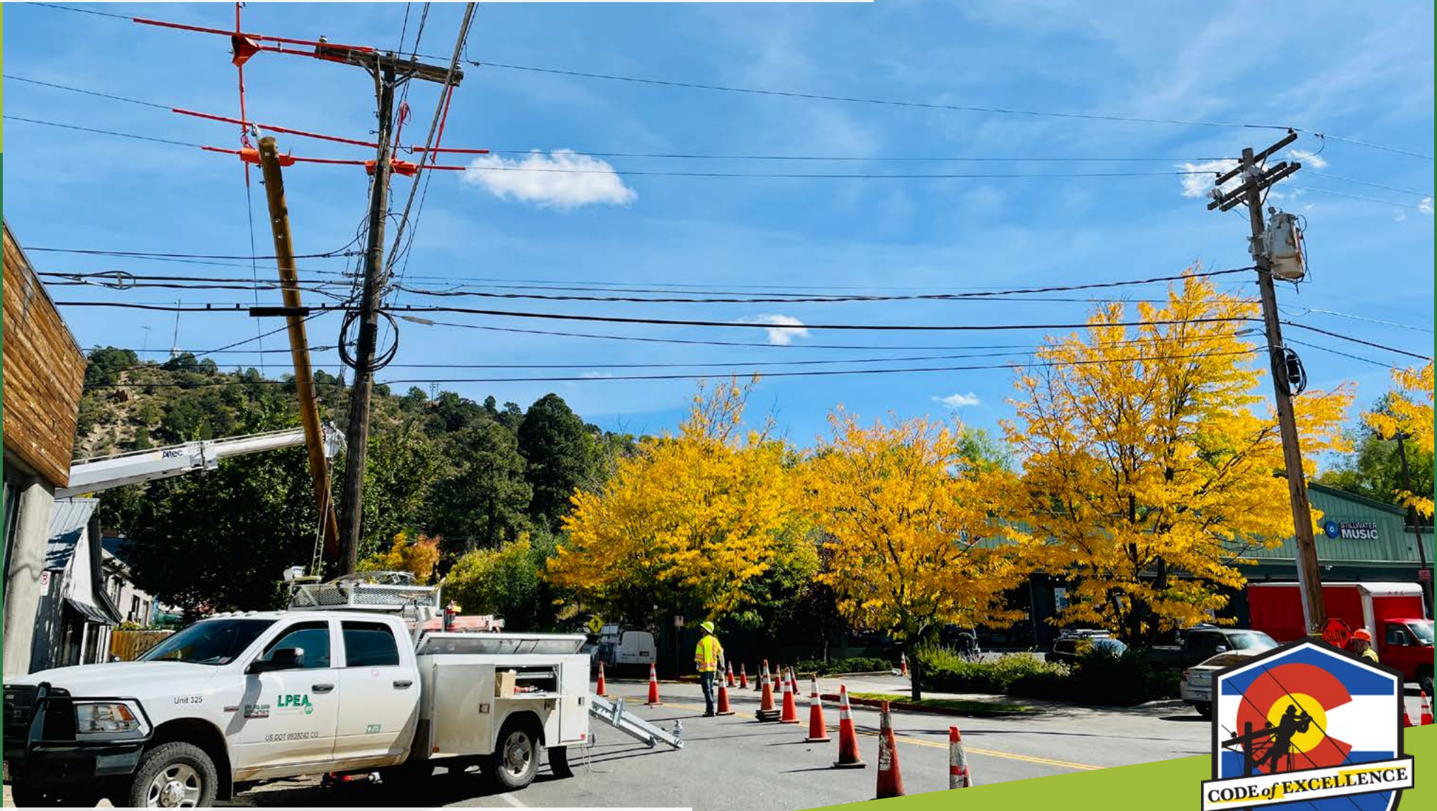
A new pole gets placed near 14th and Main Ave. in Durango