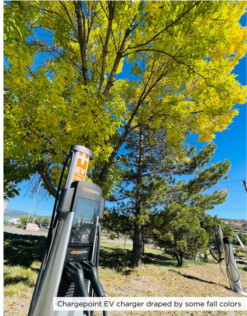
Chargepoint EV charger draped by some fall colors