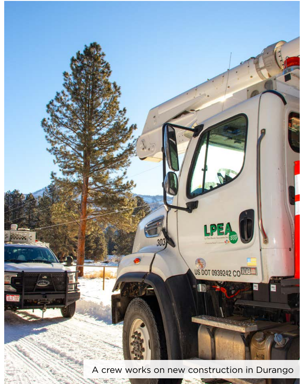
A crew works on new construction in Durango