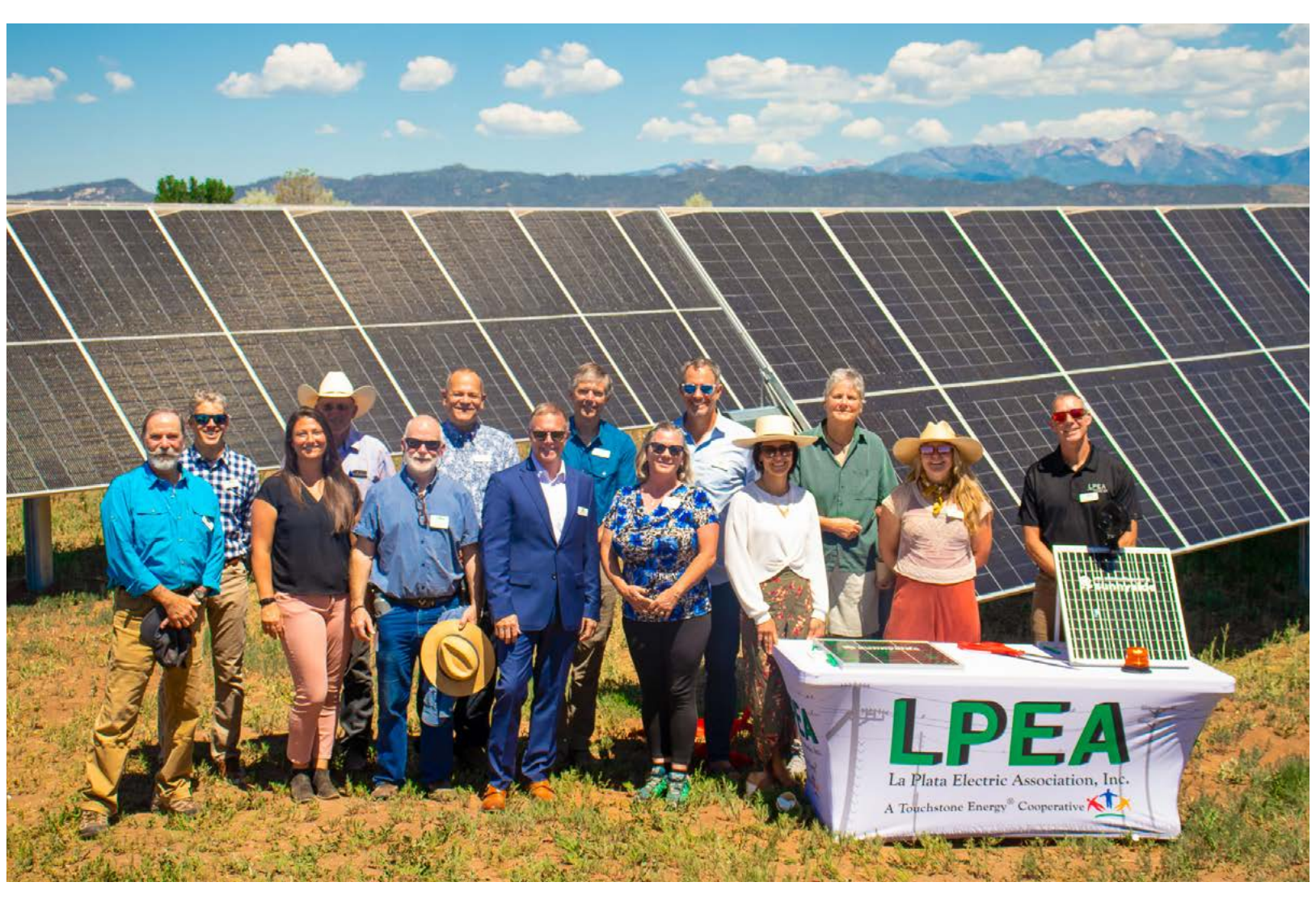
LPEA Board of Directors and key staff at the Sunnyside Ribbon Cutting.