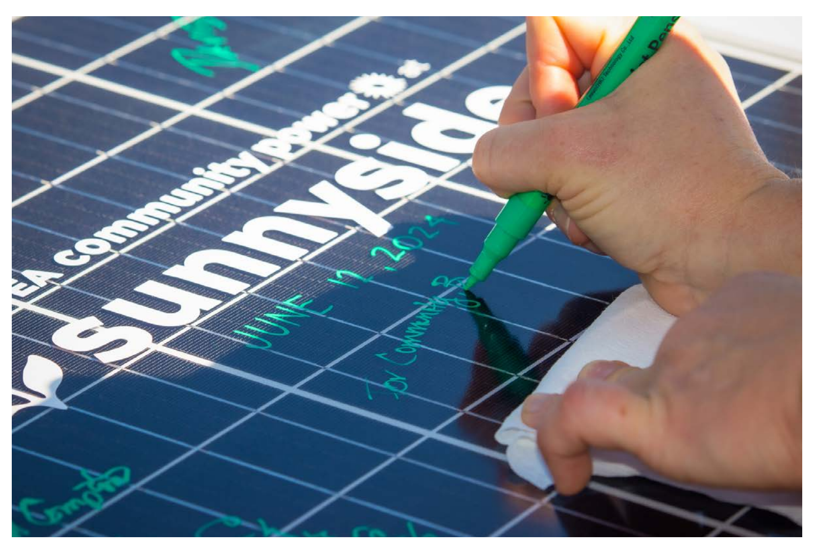
Stakeholders signed a solar panel display at the Sunnyside Ribbon Cutting.