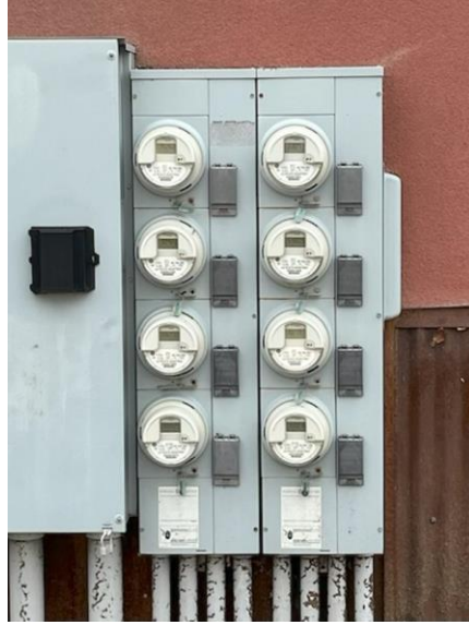
5) Ganged Meters