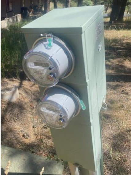
1) Meter Pedestal