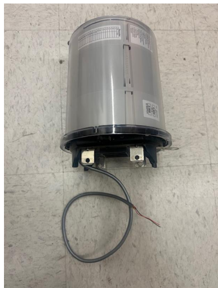
8) Pigtail Meter