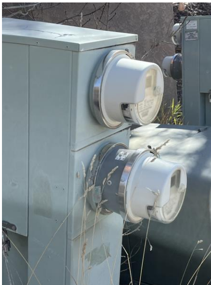
7) Surge Protector