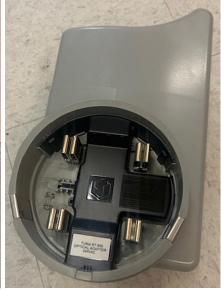
6) Shark fin