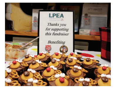
Save room for dessert! A wide array of homemade desserts will be available for an extra donation.